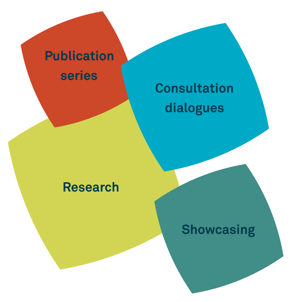
39 \\ \text{ http://doc.utwente.nl/91636/1/ProBE\%20final\%20report\%20Employability\%20of\%20professional\%20bachelors.pdf}

To help keep education and training providers and employers informed of best national and international engagement practice, QQI plans to showcase examples of effective and innovative collaborations and partnerships.