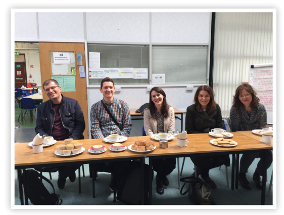
Croatian NRP delegates experience a warm welcome at DDLETB Youthreach centre, Tallaght

transparency, responsiveness, rule of law, stability, equity and inclusiveness, empowerment and broad-based participation. Nuttal's dictionary refers to 'direction, control, management', while the World Book set it out in terms of 'government, rule, control'. Project governance is defined as 'those aspects of governance which are related to ensuring the effectiveness of projects. In essence, project governance is about helping to ensure that the right projects are done well.'