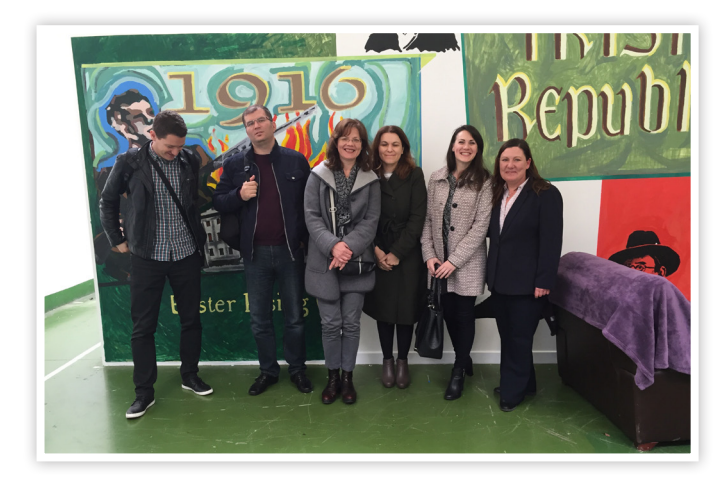
Croatian guests against a backdrop painted by Youthreach participants in DDLETB

Features then of the Wheel Governance Code, which sets out elements of governance in a user friendly way for community, voluntary and charitable organisations talks of making sure that vision, purpose and values remain relevant, developing, resourcing monitoring and evaluating a plan to make sure that our organisation achieves its stated purpose, being transparent and accountable, identifying those stakeholders who are legitimately interested in our work and making sure that we communicate with them regularly and effectively. Signing up to the code means that we commit to the standards of these principles and that performance will be reviewed against it annually.