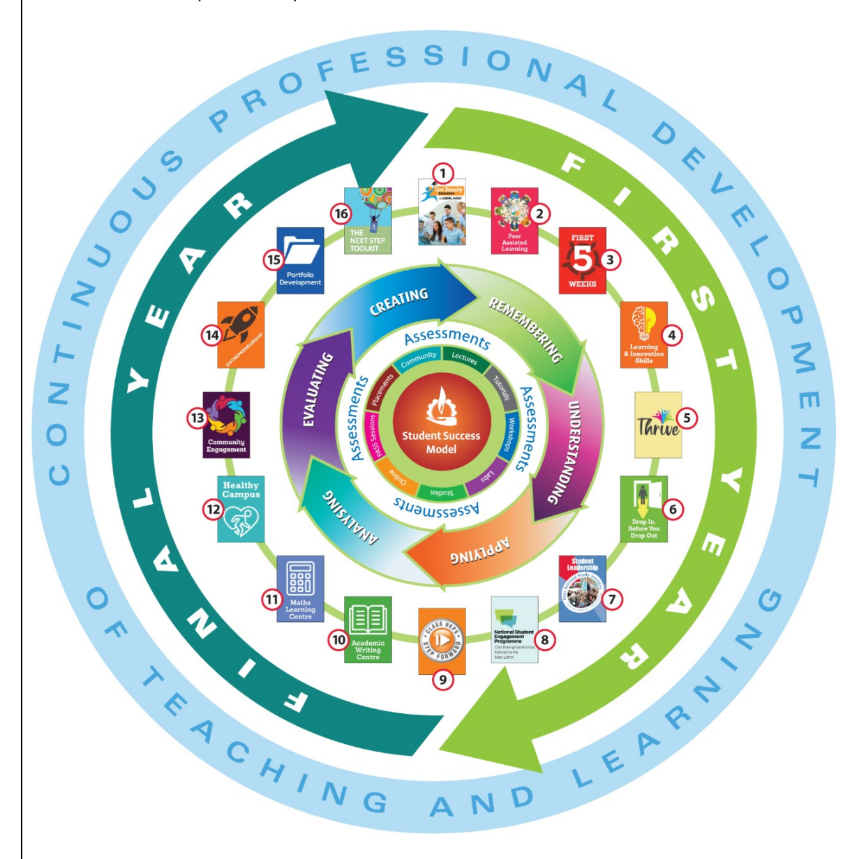
Figure 2: Building a Student Success Model at GMIT

16. The Next Step – Employability Toolkit (the module was first introduced in 2015 and the online employability toolkit in 2019) aims to support students as they transition out of GMIT. Students develop both professionally and personally and are equipped with the skills and knowledge they need to enable them to plan for and achieve their career goals. Students analyse an occupation and industry sector and devise a career strategy. They also undertake a skills audit, complete a personality assessment, prepare a CV, develop an elevator pitch, prepare for interviews and develop a LinkedIn profile.